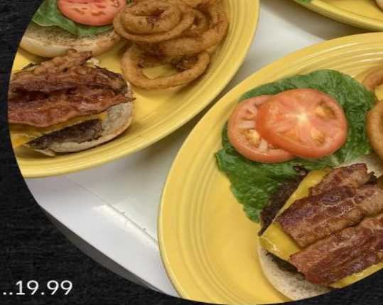
BURGER WITH CHEESE AND BACON

Black Bean Burger.....18.99 add vegan cheese 1.99